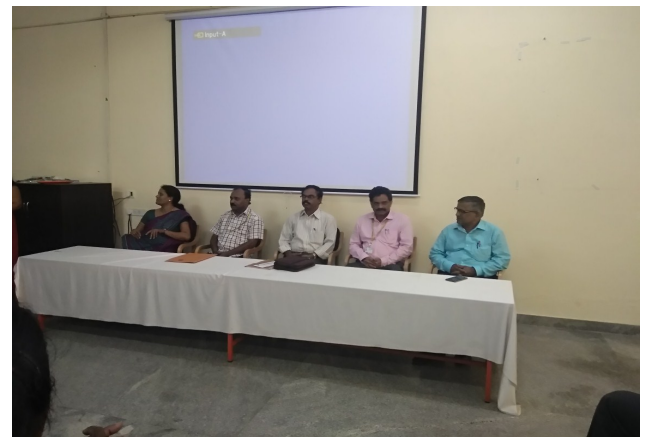
Debate competition on Tobacco A Threat to career and Life

“Coming together is a beginning; keeping together is progress; working together is success”