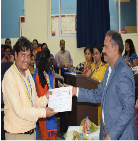
Best Teacher Award